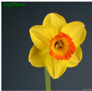
Bantam, 2 Y-YOO, Barr and Sons, England, 1950 CL Photo #1221, Feb 12, 2006

'Bantam' , 2 Y-YOO, this intermediate sized daffodil is a standout in the garden. It has roundish, blunt, brilliant greenish yellow perianth segments with a bowl-shaped corona that is smooth or lightly ribbed orange, has a broad yellow zone at the base and sometimes has a darker orange at the rim. This late blooming daffodil was registered prior to 1950 and hybridized by Barr and Sons from England, UK. 2024.