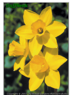
Sweetness, 7 Y-Y, R.V. Favell, England, 1939 Photo #11386, Dec 31, 2007

The International Collection – Five different Standard cultivars from five different countries. Name, division, and country of origin to appear on the labeling. Scotland, Wales, England, Northern Ireland and the Republic of Ireland are recognized as different countries. "Eligible for the Purple Ribbon." The winner will receive a $50 gift card to the boutique.