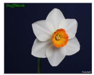
Abtruse, 3 W-R, David Jackson, Australia, 2005 Photo #8970, Mar 12, 2007: Kirby Fong, USA